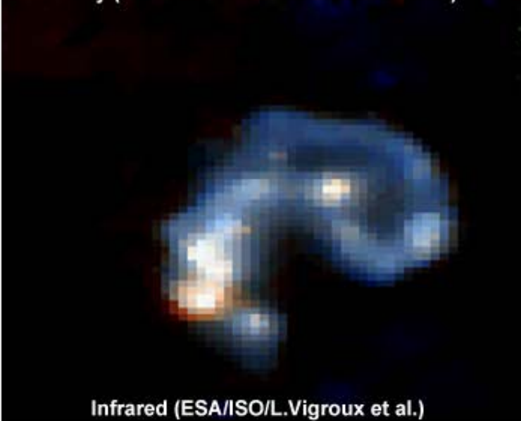
Infrared (ESA/ISO/L.Vigroux et al.)